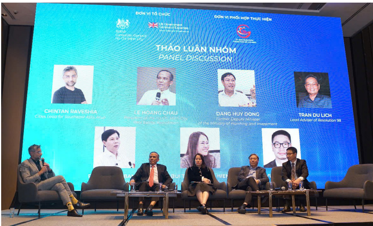
TOD workshop in HCMC, Vietnam

The Government of Ukraine requested support from the UK, recognising its reputation in infrastructure planning and decision-making, with the UK's 5CM recognised by the G20 as an international standard for business case development. And through the previous FCDO-funded Global Infrastructure Programme, NISTA's international team had produced the international business case guidance, based on the 5CM, and had experience and capacity to provide international support and capacity building. However, demand for support in 5CM quickly outstripped the capacity of NISTA's small team to support and provide much-needed political economy insight to support reform. At the request of the British Embassy in Kyiv and NISTA, GCIEP was able to rapidly mobilise a team of international experts to support NISTA to scale their 5CM training in response to demand and support the adoption of the 5CM into law.