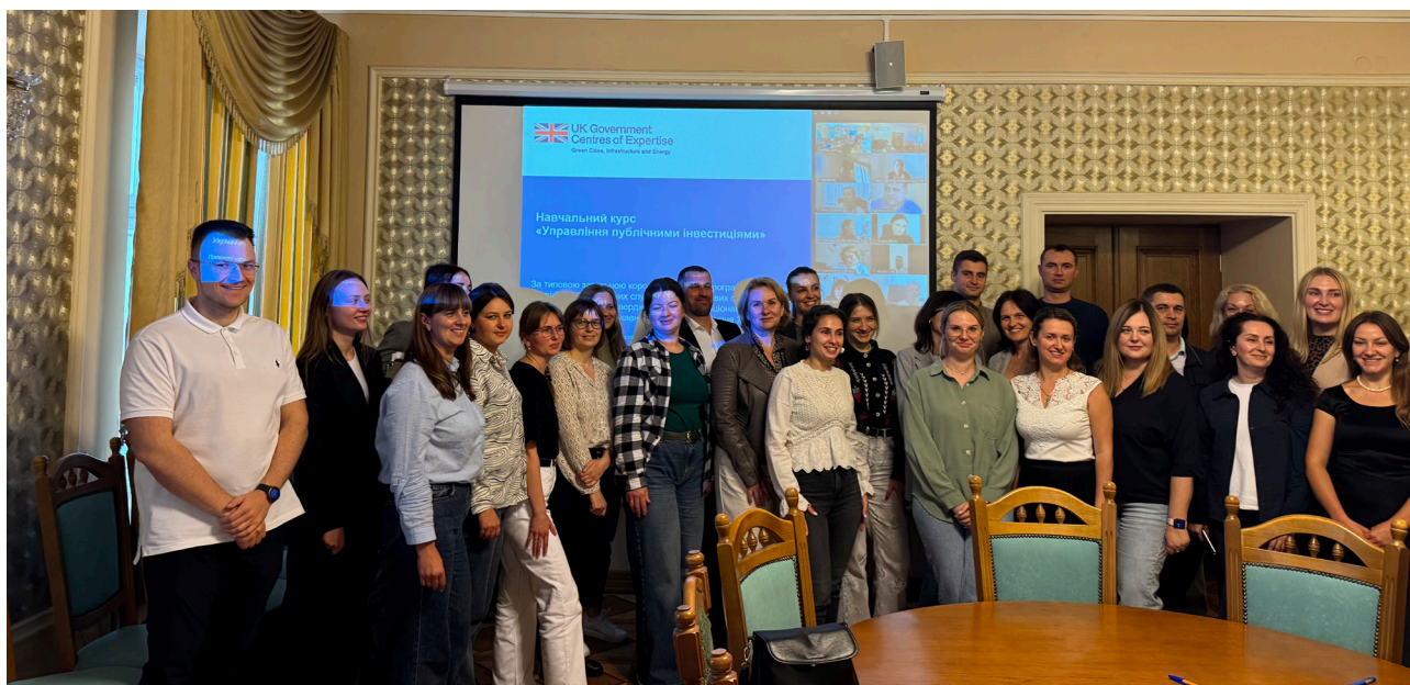
5CM training, Ukraine, September 2025